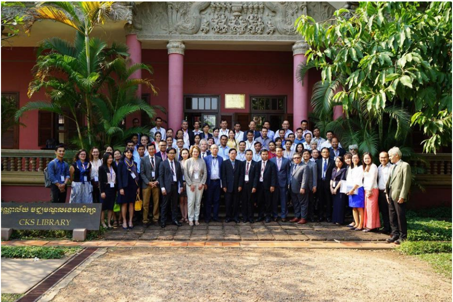
The GReSH-CAM team and the participants of the first workshop on Developing Research Capacity in Social Sciences and Humanities (Siem Reap, Cambodia — March 2018)