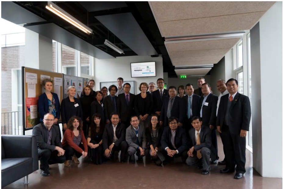
The GERE SH-CAM team during the kick-off meeting at Inalco (Paris, France — November 2016)