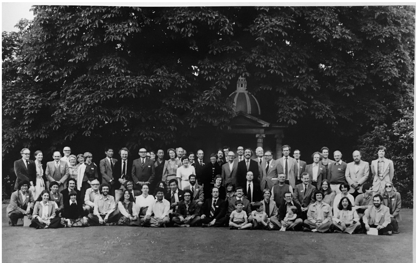
The Inaugural Meeting of the IATS St. John's College, Oxford, July 1979